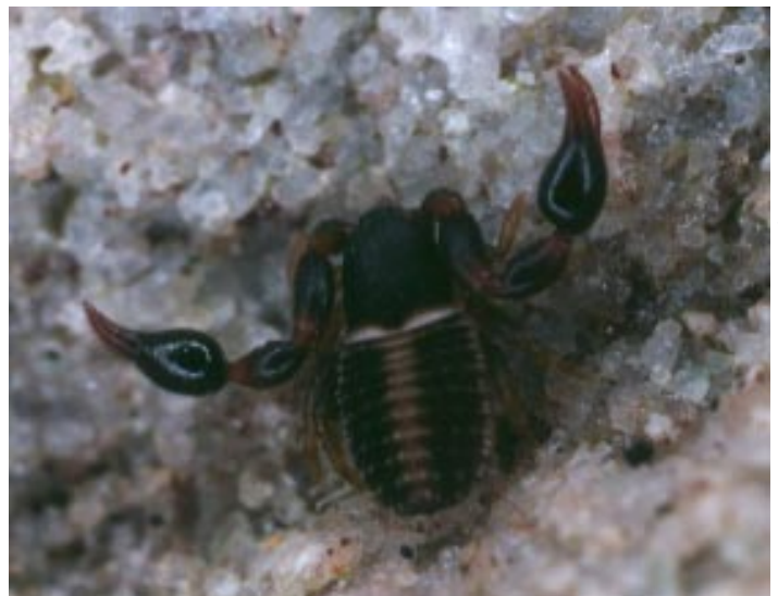
A pseudoscorpion, Parachernes virginica