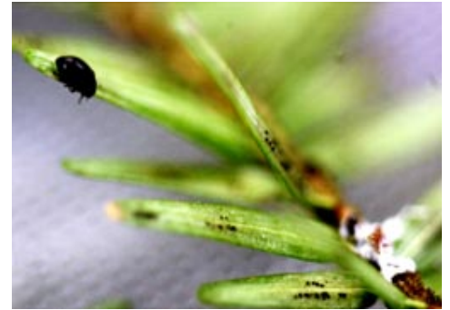
Lady beetle, Pseudoscymnus tsugae, released to control the hemlock woolly adelgid.