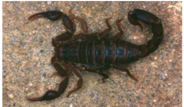
The scorpion, Vaejovis carolinianus

How do you capture these animals? For scorpions—by the tail. Quickly and carefully ! When disturbed, they usually assume a defensive posture, with their tails curled up and the stinger at the ready. A quick grab with thumb and forefinger on either side of the tail and stinger and— voila! Now what???? Drop it to release it, or collect it with forceps or a stick and vial. To find pseudoscorpions, place leaf litter, rotting wood, or loose bark into a pan that has the bottom replaced with 1/4 to 1/2 inch mesh hardware cloth. Small organisms can then be sifted into a nested pan or onto a light colored surface. Pseudoscorpions typically assume a defensive posture and probably won't start their regal crawl for 10-15 minutes. Under a strong hand lens or dissecting microscope you can see that their bodies are studded with many long and delicate hairs that are sensitive to touch, even from the slightest air movement. Be patient. One might scuttle away, crawfish-style, or defensively snap its appendages so tight against its body that it resembles a speck of dirt or leaf.