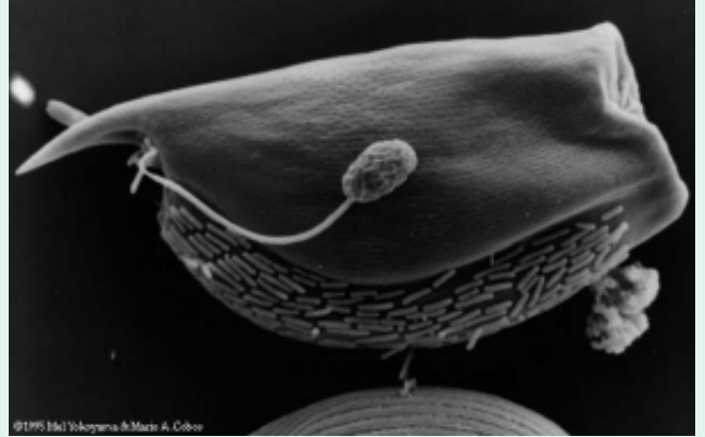
Scanning electron micrograph of a rumen microbial assemblage including the largest cell, a protist, with a fungal spore attached to it and dozens of bacteria affixed to its underside. The image is 40 microns in width and is representative of microbes associated with animal digestive tracts. It is used with permission by Mel Yokoyama and Mario A. Cobos.

The last news from the prokaryote front is the most fascinating; that of the discovery of unique archaeal species in GSMNP.